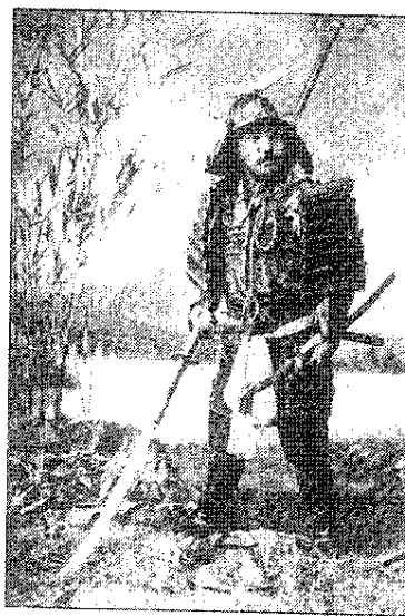
A Samurai in Full Armor

preparer boiled the water and prepared the tea. The motions of the tea server followed a slow and graceful ritual. The Samurai drank the tea in three sips, the last sip being a loud "slurp." He and other guests often admired the beautiful tea utensils, and sometimes composed poetry or played the lute. In this sanctuary of tranquility, beauty, and ritual, samurai could put aside the cares of the warrior's world.