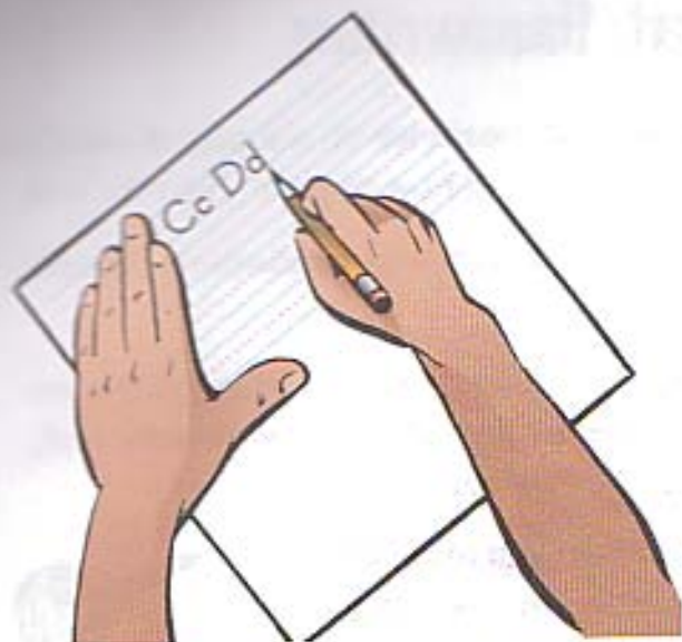
Correct Right-Handed Position

Paper is placed on an angle to the left. Left hand steadies the paper and moves it up as you near the bottom of the page. Right hand is free to write.